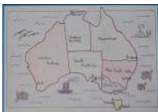
Leanne's map of Australia