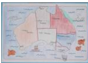
Brittany's map of Australia